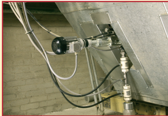
Online UBC sensor on an ash bunker.

Microwave resonance measurement with patented sample collection and treatment: The most commonly used UBC online sensor worldwide.