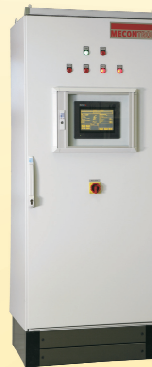
MECONTROL base station